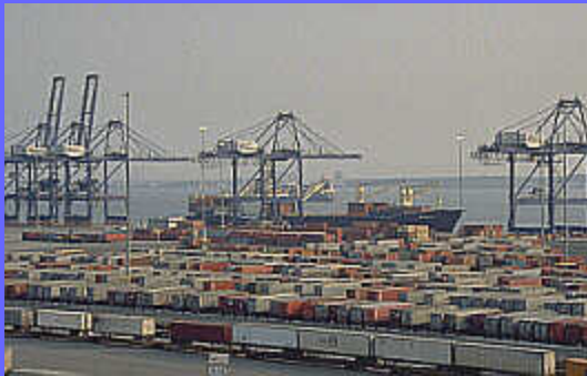
Seagirt Terminal ICTF